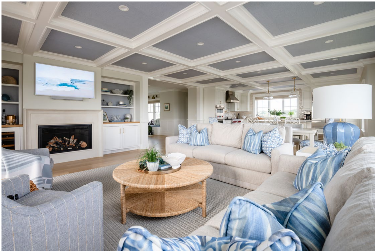
A cast concrete fireplace surround by Elements Concrete blends in seamlessly. Dual sofas by LEE industries with Schumacher trim anchor the living room space. A hammered nickel sink by Native Trails adds interest to the bar area.