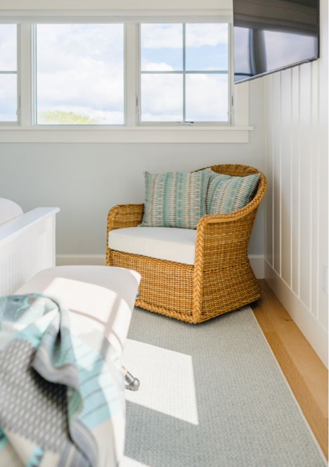
Vertical tongue & groove paneling in the primary bedroom frames the ocean view. A serene color palette with accents of natural materials creates an elegant and calm space. The Quadrille fabrics pillow and coastal art pull the colors of the room together.