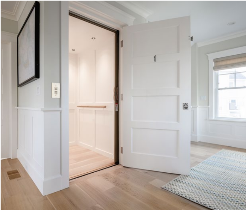
Wainscot paneling that carries from the entry to third floor is incorporated into the elevator’s interior design. The primary bath tiles mirror the colors of the adjacent bedroom, blending marble mosaics and porcelain materials for a high-end look.